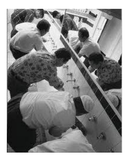
Muslims taking their ablution before congregational prayer (in this case, Friday Prayer) at the Canberra Mosque.

CMI remains the custodian of the Canberra Mosque to this day. The Muslim community at the time of the Canberra Mosque opening comprised mainly diplomatic staff from Muslim countries represented in Canberra. Initially the Mosque was run by the founding Missions. As the Muslim community grew in numbers in Canberra and its surrounding region, the Islamic Society of the (ISACT) was formed in 1972, among other things, to also run and manage the day to day affairs of the Mosque, support and represent the Muslims using the Mosque.