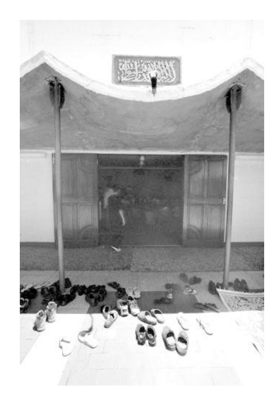
Photo above shows the entrance to the Mosque taken some 20 years ago. Worshippers are required to take off their shoes before entering the prayer hall.

From around 30 or so Muslim families residing in Canberra in the early 1970s, the Muslim population in Canberra and its surrounding region has now grown to around 8,000 persons. In the past Eids (major annual Muslim celebrations) the Eid congregational prayers were held at the Australian Institute of Sport (AIS) where around 3,000 to 4,000 persons from all over Canberra region participated.