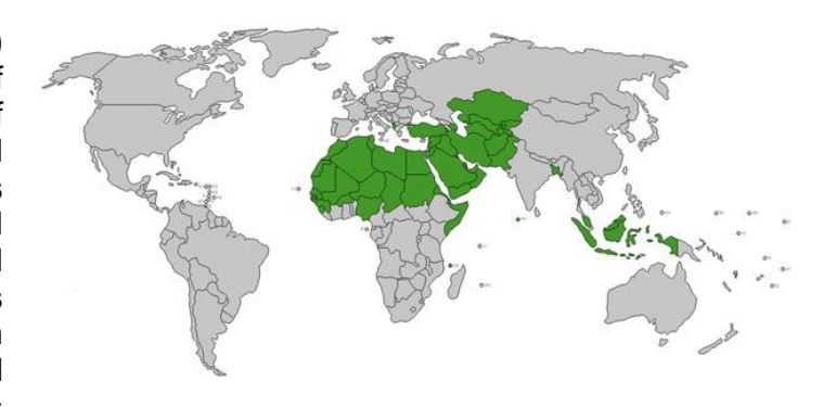
Map of the world of Muslim majority countries

The Arabic word Masjid (mosque) literally means a place prostration. A mosque is a place of worship for followers of Islam and serves as a place where Muslims come together for prayers as well as a centre for information and religious education. Mosques originated on the Arabian Peninsula, but are now found in all inhabited continents as Muslims moved to other parts of the world.